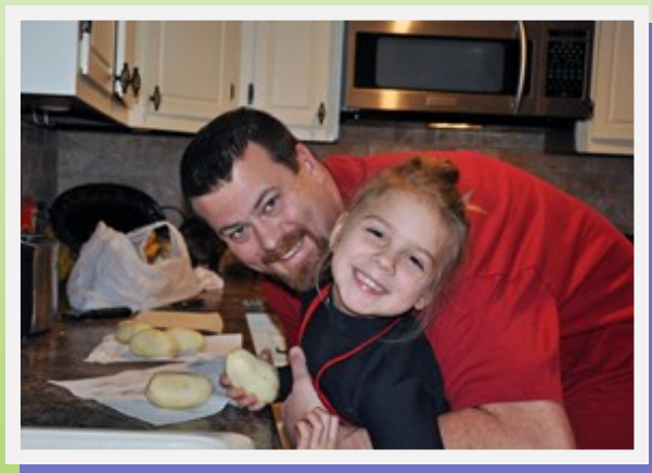
Daddy passing down his cooking skills