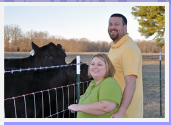
Petting Bossy and Flower