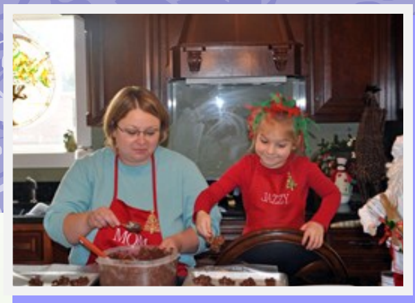
Making Christmas cookies with Momma