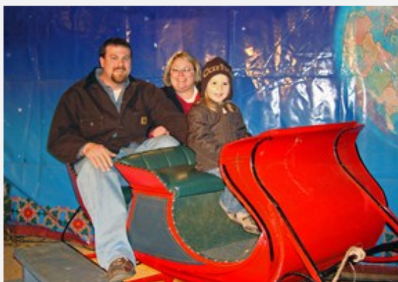
Going for a sleigh ride at Santa Village