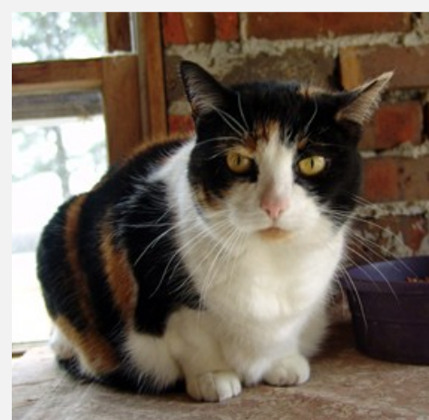
One of our furry friends, Coco